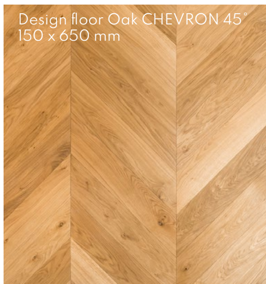
Design floor Oak CHEVRON 45° 150 x 650 mm