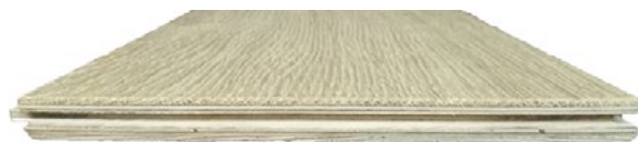
Standard product: Birch plywood structure