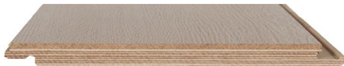
Standard product birch plywood construction