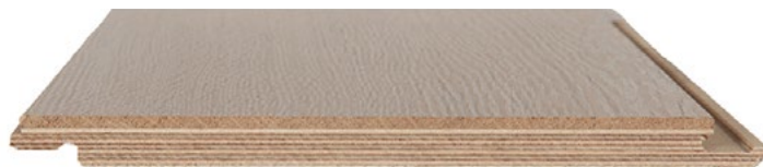
Standard product birch plywood construction