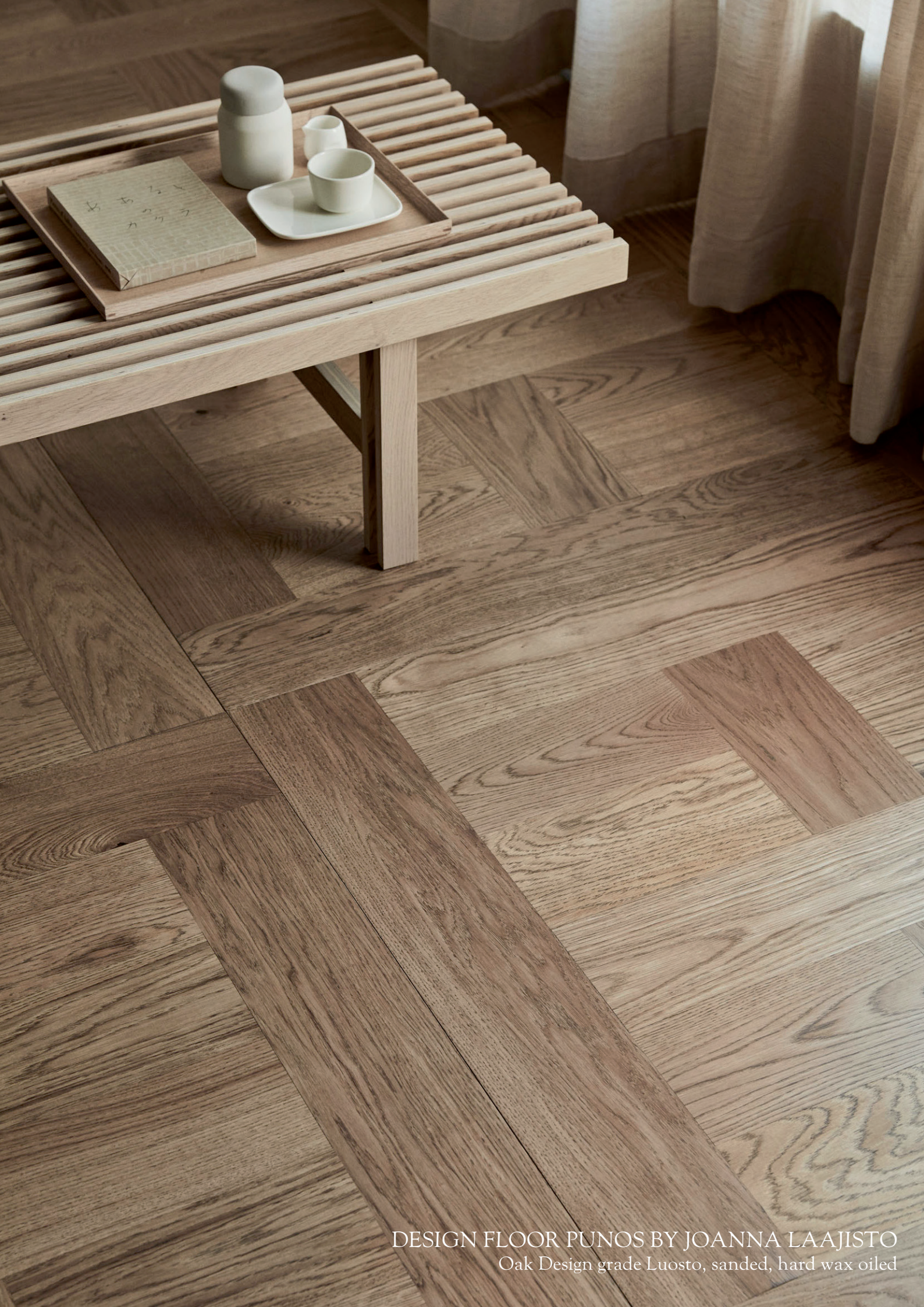
DESIGN FLOOR PUNOS BY JOANNA LAAJISTO Oak Design grade Luosto, sanded, hard wax oiled