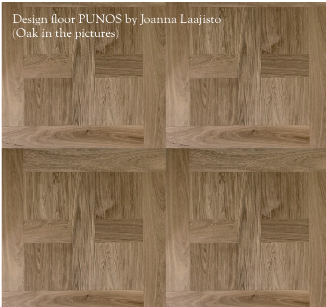
Design floor PUNOS by Joanna Laajisto (Oak in the pictures)